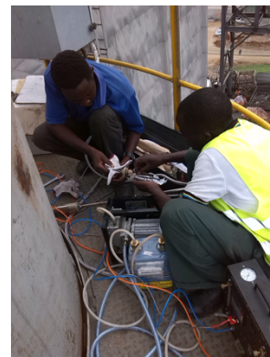
Field work at Lake Cement Factory in Kigamboni, Dar es Salaam